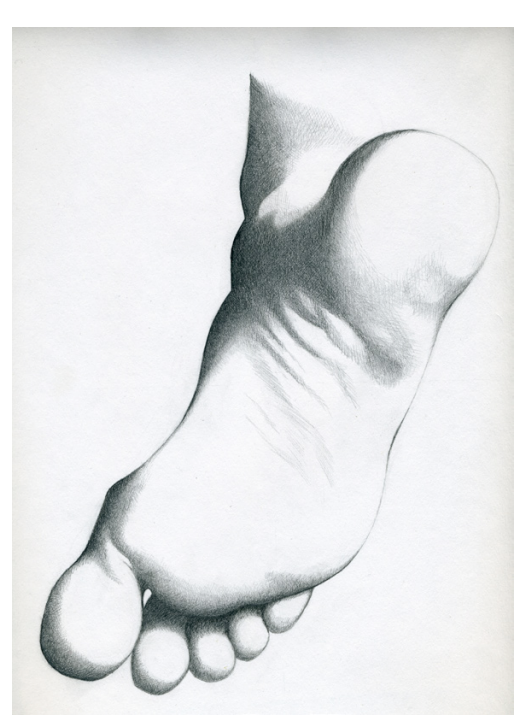
Content and drawings © Deb Merrill 2016